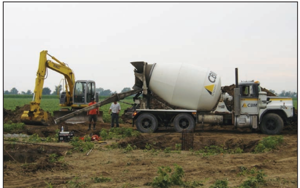
July, 2007 - Cement is poured during the construction of the permanent wind measurement mast base.

Once again, I would like to express, on behalf of the entire KEPA team, our sincere thanks for the opportunity to partner with the community of Chatham-Kent. As I have said many times in the past, the population has welcomed Kruger Energy and KEPA to the community and has supported and embraced our project from the beginning; for this we are truly grateful.